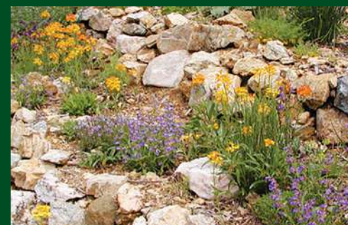
Wallflowers and Blue Mist Penstemons