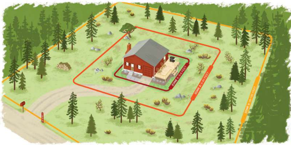
Illustration: Bonnie Palmatory, Colorado State University

This fact sheet covers plants in zones 1 and 2; a different publication; the Fire-Resistant Landscaping fact sheet, discusses plants in zone 3. For a defensible space plan for properties, contact the nearest Colorado State Forest Service field office or local CSU-Extension office for guidance. Consult with a forester, fire department staff or community organization appropriately trained in wildfire mitigation practices.