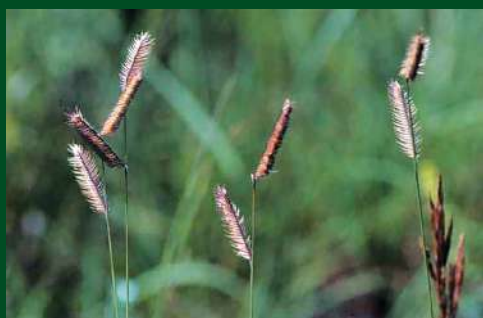
Blue Grama Grass