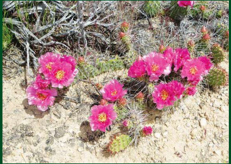
Opuntia

Colorado State University Extension is an equal opportunity provider. | Colorado State University Extension es un proveedor que ofrece igualdad de oportunidades.