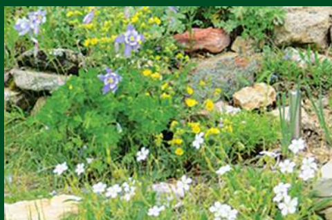
Geranium and Rocky Mountain Columbine