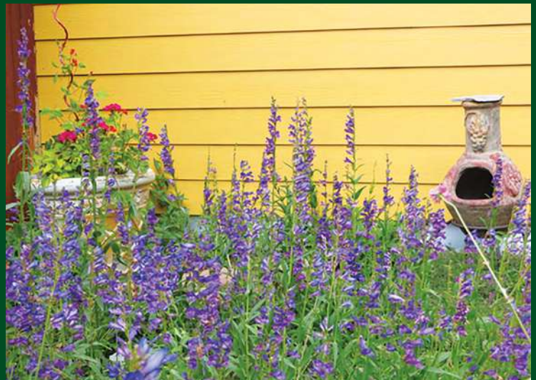
Rocky Mountain Penstemon